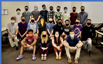
Figure 1. ENGR-333-A students

Design: Used estimations from the other 4 teams to generate alternative alternatives for the house builds to reduce carbon emissions by 20%