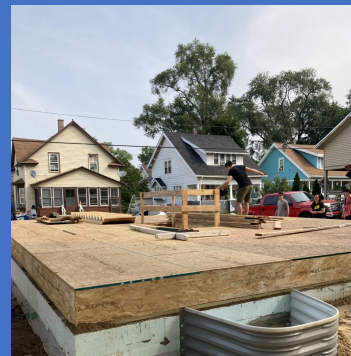
Figure 2. London house during construction

Solar Water Heater: A solar water heater reduces the amount of energy required to run the water heater, reducing the carbon emissions caused by electricity consumption